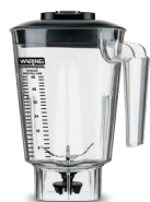
CAC132 1.4 Lt. Copolyester Blender Container