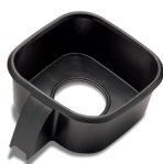
CAC143 Jar Pad