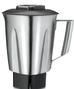
CAC138 1.4 Lt. Stainless Steel Blender Container